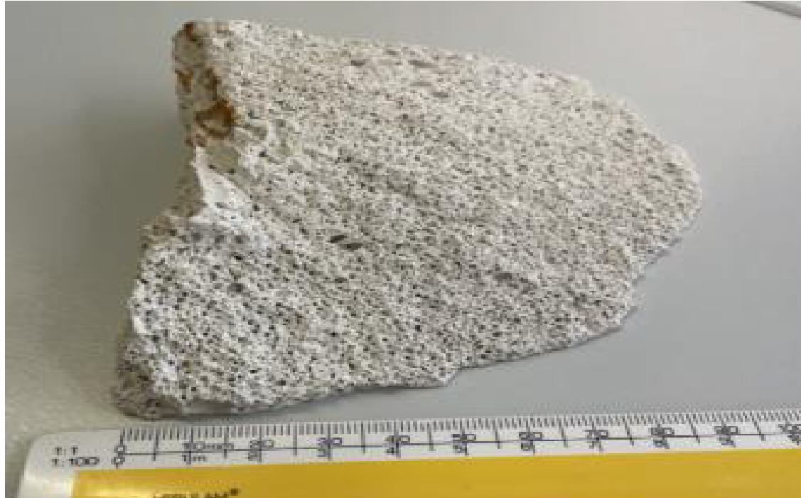
Figure 2: A fragment of RAAC showing its 'bubbly' appearance