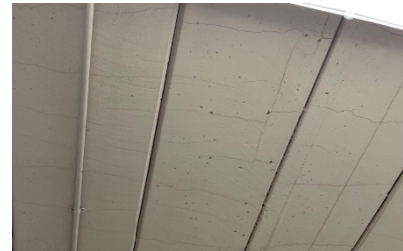
Figure 77: Underside of a cracked RAAC panel