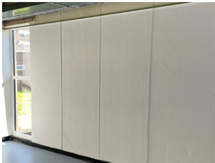
Figure 5: Example of RAAC on internal wall face