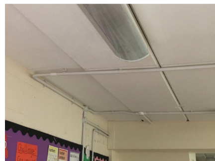
Figure 1010: Example of deflected RAAC panel

RAAC panels may bow or deflect. From the underside of the roof or floor you may see a 'gap' between two adjacent panels.