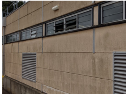
Figure 4: Example of RAAC in walls