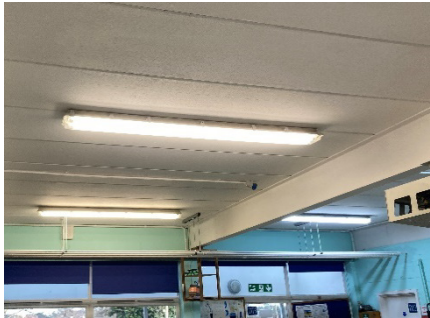
Figure 3: Example of RAAC in flat roofs and floors

RAAC panels are most commonly found on flat roofs, they may also be found in pitched roofs, floors or walls.