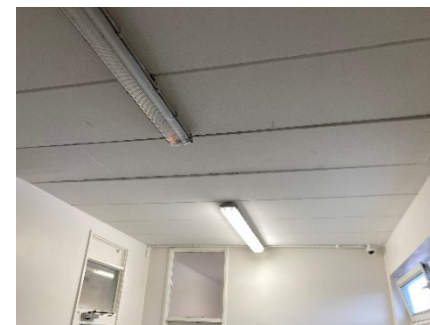
Figure 1111: Example of deflected RAAC panel