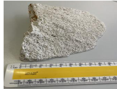
Figure 6: Aerated appearance of RAAC

RAAC panels are light-grey or white in appearance, the underside of the panels will appear smooth. The inside of the planks will appear bubbly, often described as looking like an Aero bar. Unlike traditional concrete, there will not be visible stones (aggregate) in the panels.