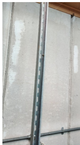
Figure 99: V-shaped grooves at 600mm spacing