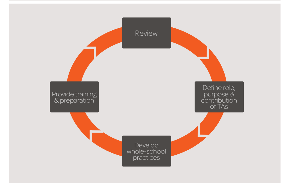
Figure 3. A process of school improvement regarding the use of teaching assistants

Figure 3 shows a model for school improvement that SLTs have previously found useful in reviewing the current use of TAs and guiding a process of change. This should shape an action plan for your school, which can then act as a foundation for training and deploying staff. Importantly, training should include supporting teachers in how to work effectively with TAs.