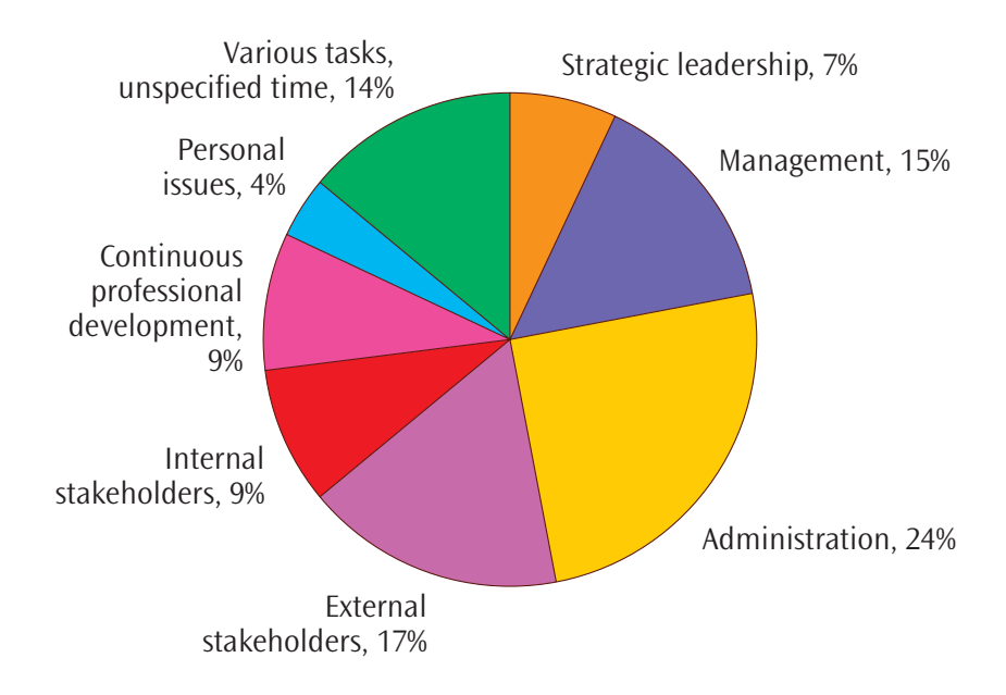
Figure 1: Proportion of headteacher time for each broad task group

Note: Figures do not sum to 100 per cent due to rounding